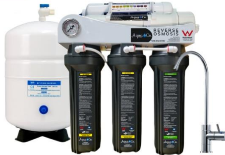
AquaCo Reverse Osmosis System

Our NEW Faucets feature an LED indicator that turns from blue to red when the filter needs replacing.