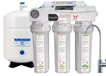
USA Reverse Osmosis System