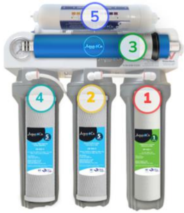
AquaCo Replacement Filters Bundle