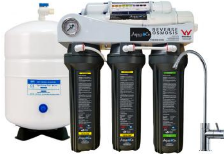
AquaCo Reverse Osmosis System

Our NEW Faucets feature an LED indicator that turns from blue to red when the filter needs replacing.