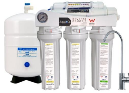
USA Reverse Osmosis System