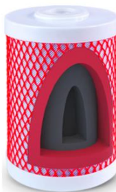
Made in Europe