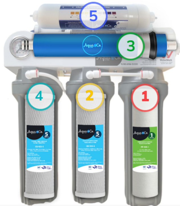
AquaCo Replacement Filters Bundle