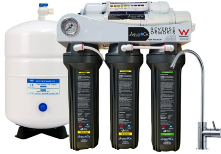
AquaCo Reverse Osmosis System

Operating Pressure: 240-600 kPa Operating Temperature: 5-35°C Connects To: 1/2" Cold Water Line Membrane Flow Rate: 16 L/h System Outflow Rate: 3 LPM